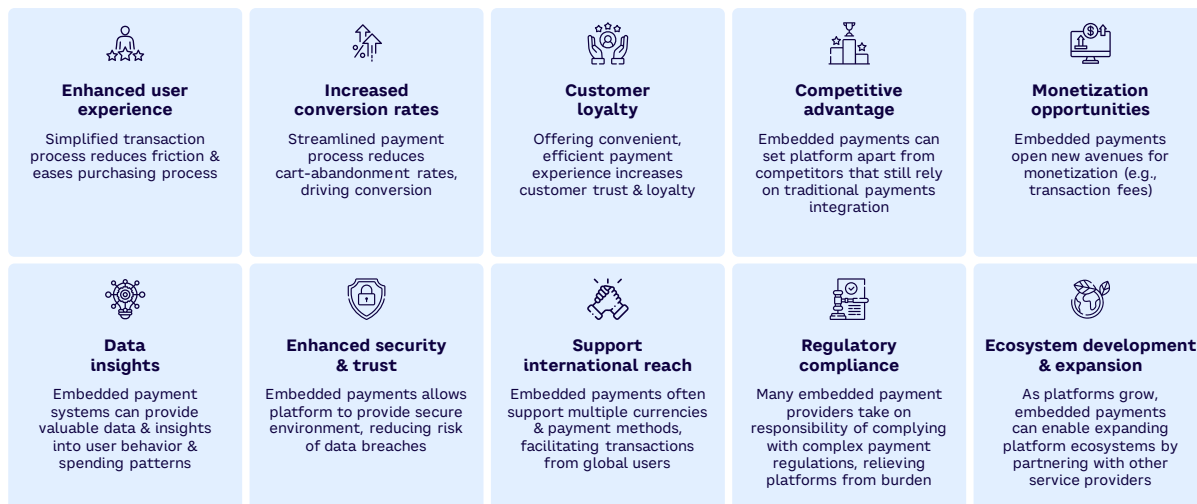
Figure 2. Benefits of embedded payments for embedders

The commercial and customer benefits of embedding payments are obvious to embedders that have championed this shift in how customers pay and how businesses receive payments. Figure 2 highlights the many benefits of embedded payments.